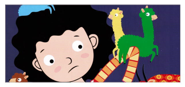
Text copyright © 2017 by Judy Cox. Illustrations copyright © 2017 by Nina Cuneo.

Clarissa couldn't fall asleep, so she counted sheep, one by one. Still no sleep and she ended up with 10 naughty sheep in her room. What about counting pairs of alpacas, 2, 4, 6 ... to 20? That didn't work either; 20 alpacas crowded in, too. She counted groups of 5 llamas up to 20, and groups of 10 yaks up to 50. Again, no sleep and now 100 stinky animals were messing up her room. How can Clarissa get rid of all these animals so she can sleep?