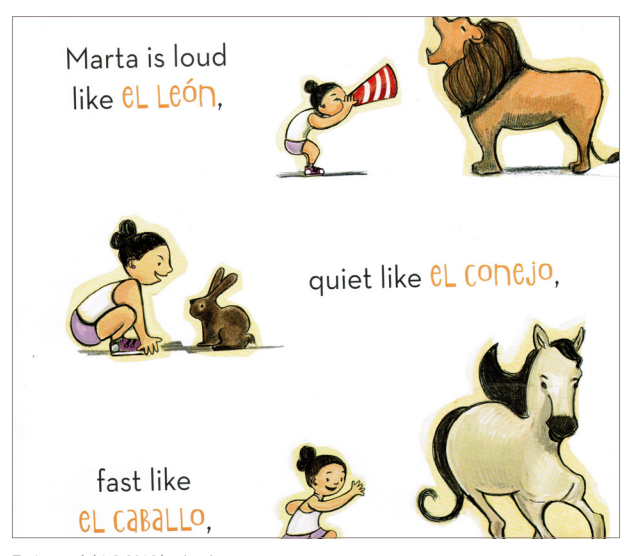
Text copyright © 2016 by Jen Arena Ilustrations © 2016 by Angela Dominguez